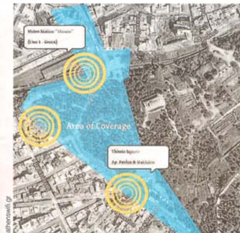
Map of the Wi-Fi coverage of the Thiseio hotspot

The northern city of Trikala already has a free Wi-Fi hotspot in operation.